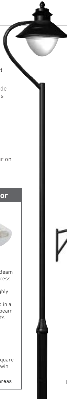
Classic Swan Neck SN/76 or 89

Note: option to select gold colour on upper canopy