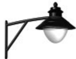
Classic Wall Mount CWM/XX L = 400-600mm

L = Distance from column to centre of lantern