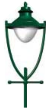
Classic Yoke CY/76 or 89